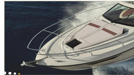
GRAN TURISMO 40

A diverse fleet operating in Ho Chi Minh City – serving charters, tours and events from 8 to 60 guests.