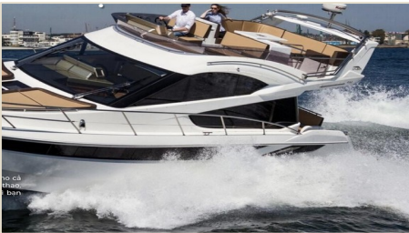
GALEON 420 FLY